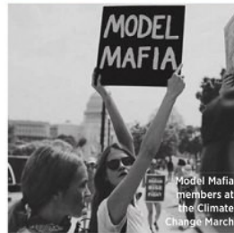
Model Mafia members at the Climate Change March